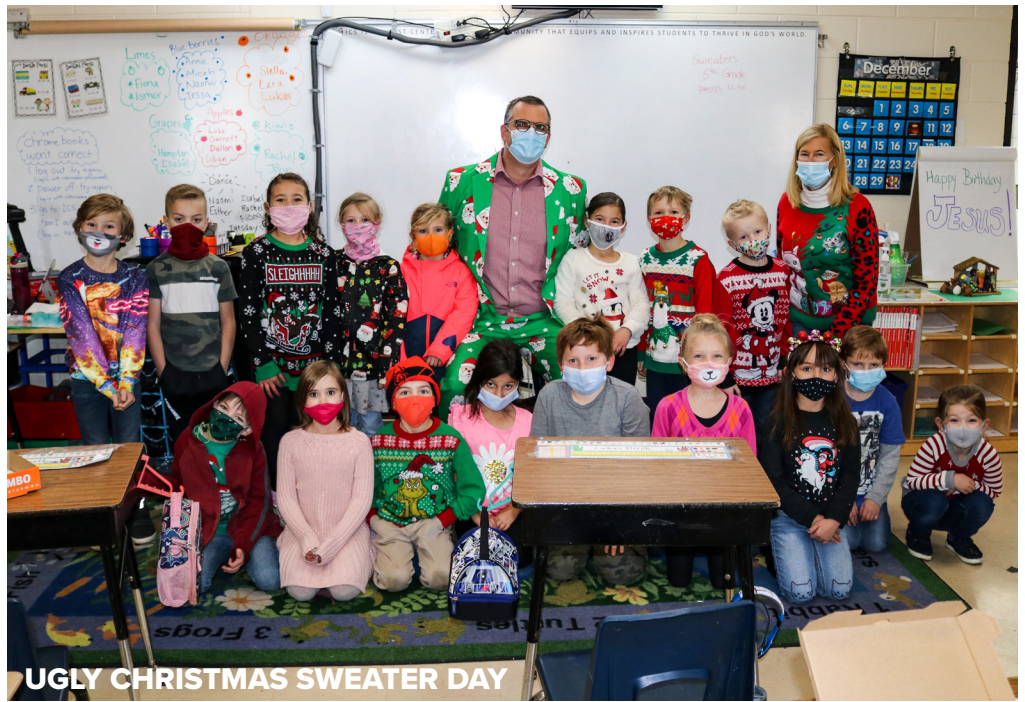
UGLY CHRISTMAS SWEATER DAY

If you haven't checked out the Lion-Cast yet, tune in and listen on Apple Podcasts, iHeart Radio or Spotify and leave a review! To listen to the Lions Radio Network, visit our website's homepage, scroll down toward the bottom of the page and press play.