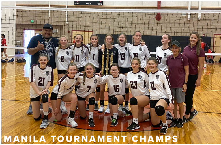
MANILA TOURNAMENT CHAMPS