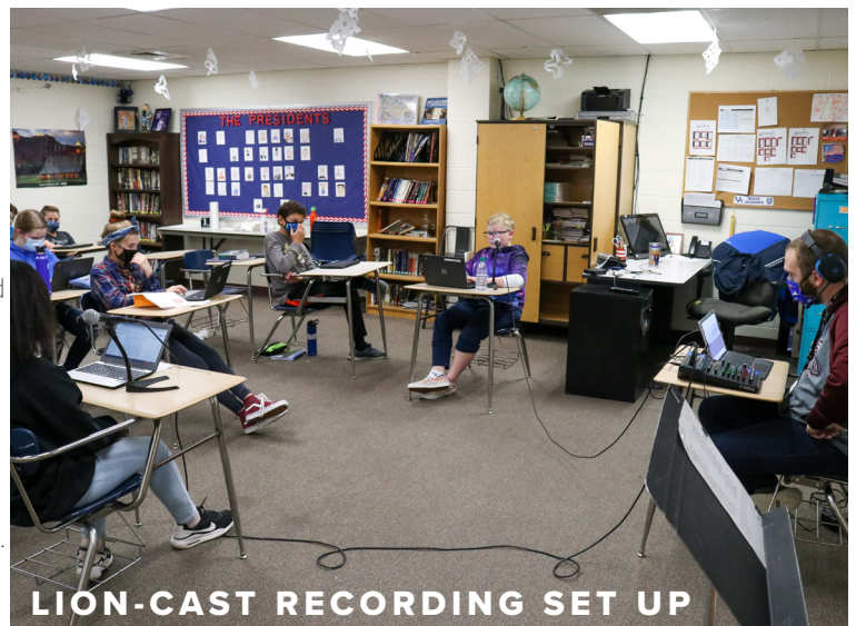
LION-CAST RECORDING SET UP