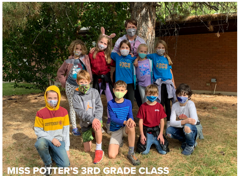
MISS POTTER'S 3RD GRADE CLASS