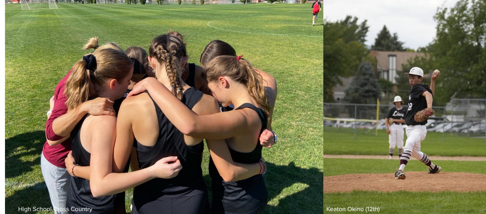
High School Cross Country